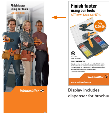
Display includes dispenser for brochures