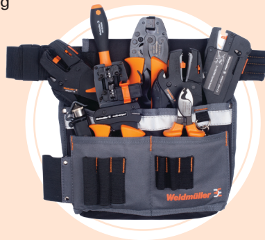
Example tool demo set