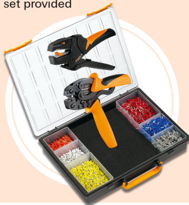
Example tool promo